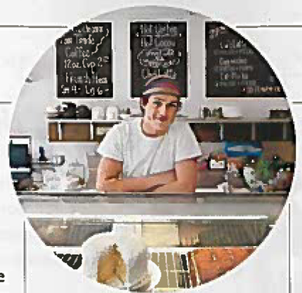
ABOVE: Lewisburg's Stardust Cafe. We suggest the toffee pudding cake. stardustcafewv.com

DO: Rent a bike at Hill & Holler ( hillandhollerbikes.com ) to see fall leaves from the Greenbrier River Trail , which meanders along the water for a full